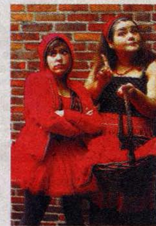
JOHN CRITTENDEN/ SHOW ME YOUR FACES

NEWARK "Modern Metal: Early 20th-Century American Sculpture," exhibition featuring a dozen bronze sculptures, including works by Gaston Lachaise, Hunt Diederich, Reu-